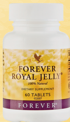
MAL20172964TC KKLIU 2467/2019