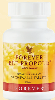
MAL16110019TC KKLIU 2467/2019