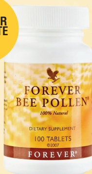
MAL16110003TC KKLIU 2467/2019